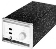
SHERWOOD SMX-A, SMX-B, SMX-S