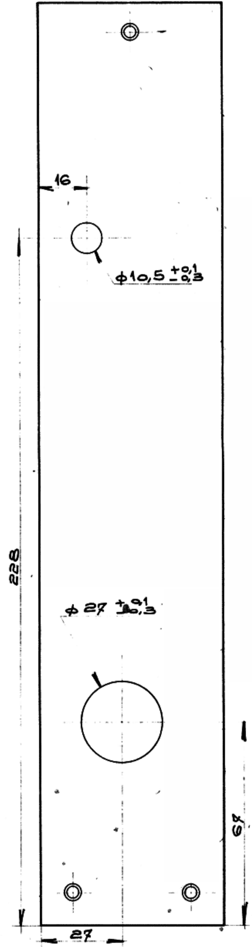
Plaquette bras ORTOFON 8/2844

D.L.M. 21 rue Jeanne D'ARC LAGNY 77 tel. 430-12-30 ERA département Haute fidelité